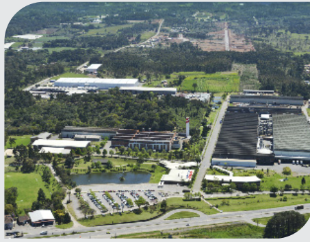
CAXIAS DO SUL SITE Brazil