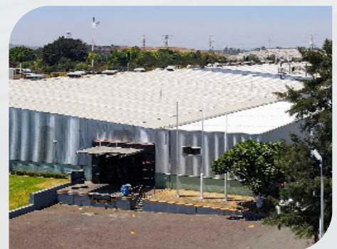
CALAYA SITE Mexico