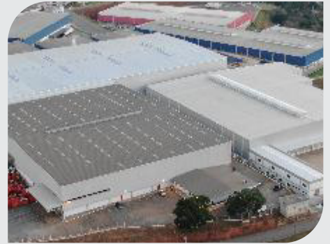
EXTREMA SITE Brazil