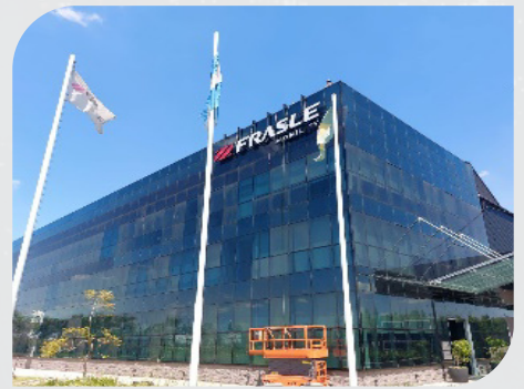
BUENOS AIRES SITE Argentina