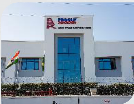
ASK FRAS-LE SITE India