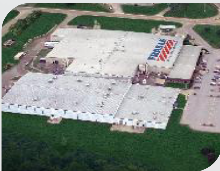
ALABAMA SITE USA