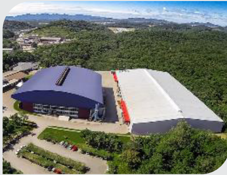
FREMAX SITE Brazil