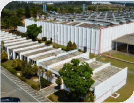
SOROCABA SITE Brazil