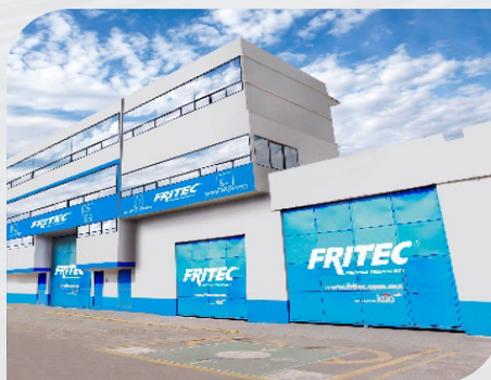
MEXICO CITY SITE Mexico