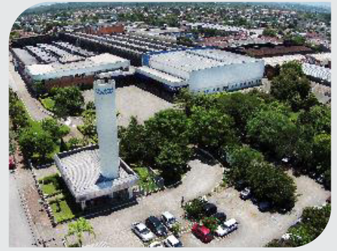
CONTROL SITE Brazil