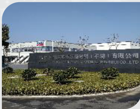
PINGHU SITE China